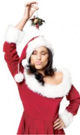
Kissing Under the Mistletoe

And if a guy takes a chance and kisses you, always be polite, even if you don't particularly feel the vibe. It's the time for peace on earth, so