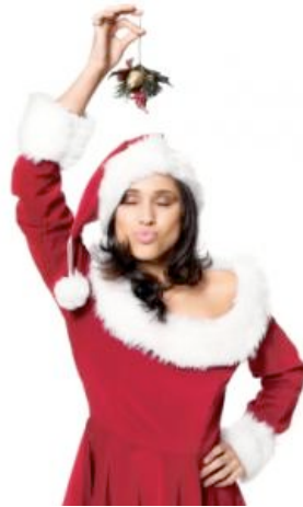
Kissing Under the Mistletoe

And if a guy takes a chance and kisses you, always be polite, even if you don't particularly feel the vibe. It's the time for peace on earth, so