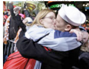
Midnight on New Year's